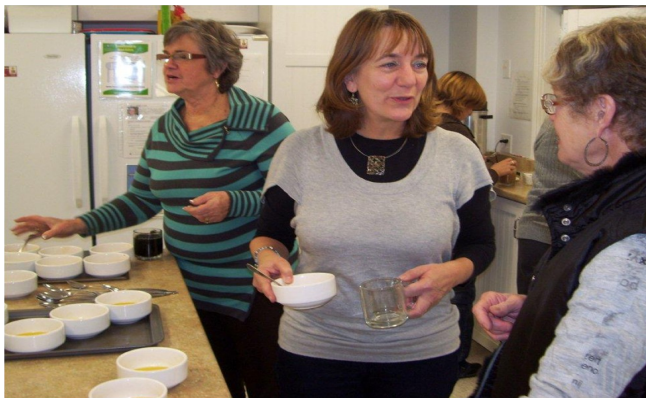
An Evening in France, sponsored by Kindred Spirits, was enjoyed by all...without the plane flight.